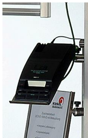
Swivelling dictaphone holder SH-SS-PH 730 Art. No. 060.020.041