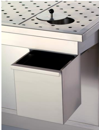
Waste shaft with extraction and stainless steel waste bin MÜ-AS-150-M Art. No. 060.012.056