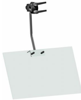
Flexible splash guard mounted to the railing system FSS-500 Art. No. 069.300.248