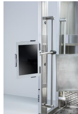
Flexible iPad/tablet holder laterally mounted to the side rails FH-TABLET-SS-300 Art. No. 060.022.036