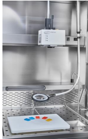
Magnifier with illumination mounted to the railing system LL-WM72-RS Art. No. 060.016.065