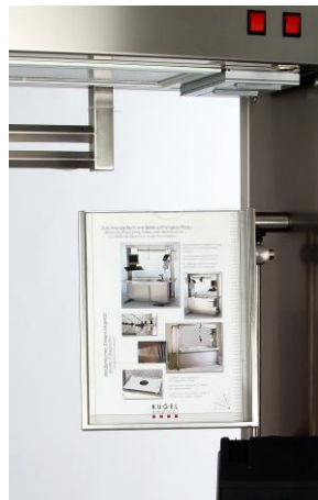
Swivelling document holder laterally mounted to the side rails DH-A4-SS Art. No. 060.012.031