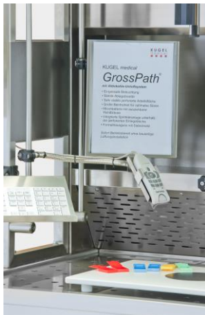
Flexible microphone holder laterally mounted to the side rails FHH-SS-300 Art. No. 060.015.036