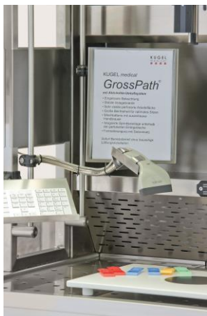
Swivelling scanner holder laterally mounted to the side rails FH-SCAN-SS-300 Art. No. 060.100.105