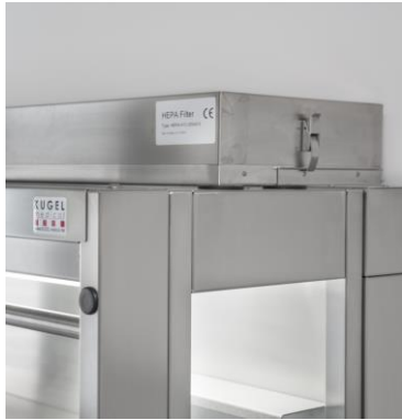
HEPA filter system mounted on top of the GrossPath GP-1500 (only available for GrossPaths!) HEPA-GP-1500 Art. No. 060.260.070