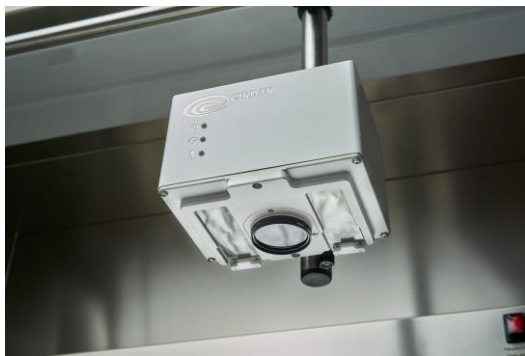
Camera holder mounted to the railing system with monitor and keyboard holder laterally mounted to the side rails suitable for the PathLite Compact camera system consisting of camera for glare-free gross imaging and suitable computer and monitor with preinstalled VividPath software.