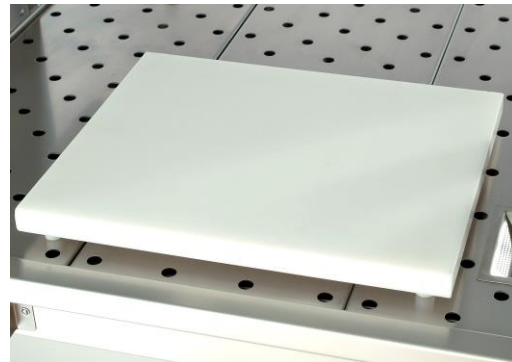
Cutting board made of polyethylene SB-PE-50/40 Art. No. 060.012.010