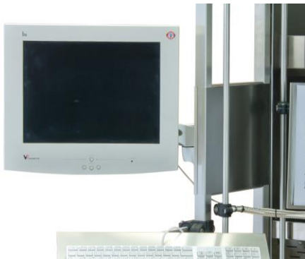
Monitor holder MT-SS laterally mounted to the side rails Art. No. 060.022.033