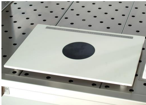
Cutting board made of Corian with a round black point SB-CO-50/40-SE Art. No. 060.012.012