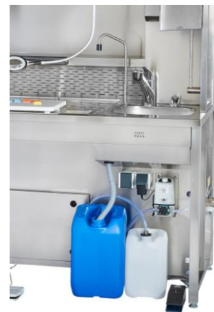
Formalin-dispensing system FDS-05/1-F Art. No. 060.012.024

KUGEL medical GmbH & Co. KG Hermann-Köhl-Str. 2A DE - 93049 Regensburg/Germany