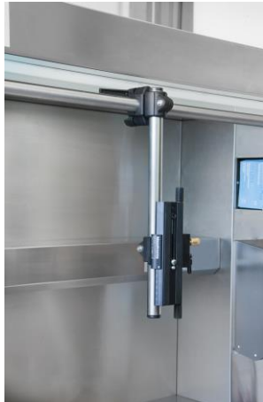
Camera holder mounted to the railing system KA-H-400 Art. No. 060.015.085