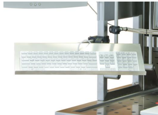
Keyboard holder THB-SS laterally mounted to the side rails Art. Nr. 060.022.080