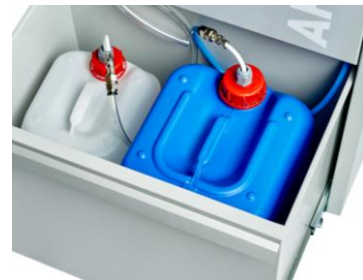
The fully automatic formalin mixing and dispensing station AFMDS-100 is designed for contact-free dilution of concentrated formalin in laboratories. Thanks to its compact design, the mixing station is also suitable for small laboratories. The integrated microprocessor within the device allows you to easily control all operations, such as mixing a 3.7% standard solution, through one single surface at the control panel with LCD display. Additionally, it is possible to prepare a customized mixture by using variable quantities of formalin, purified water and a buffer liquid. The prepared mixture can be drained directly from a tap at the device or transferred to multiple remote stations that are up to 200 meters away. Art. Nr. 099.900.196