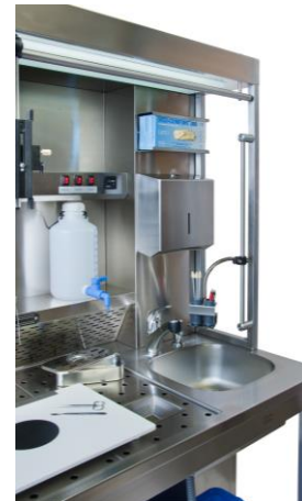
Glove holder made of stainless steel HHK Art. No. 060.020.074