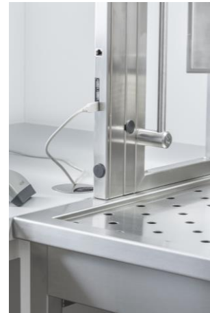
Cable channel installed around the entire illumination of a grossing table. USB and LAN ports separately available upon request.

Width cable channel 1,500 mm KK-BEA-1500 – Art. No. 060.018.120 Width cable channel 1,750 mm KK-BEA-1750 – Art. No. 060.018.122 Width cable channel 2,000 mm KK-BEA-2000 – Art. No. 060.018.124