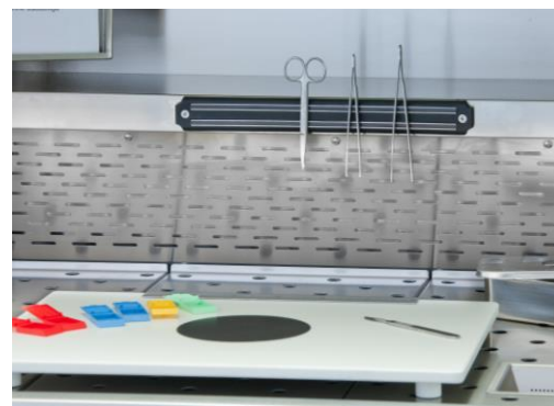
Magnetic bar for instruments mounted to the storage board MS-300 Art. No. 060.012.077