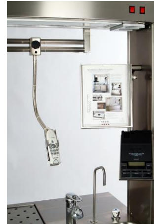
Flexible microphone holder mounted to the railing system FHH-RS-500 Art. No. 060.015.035