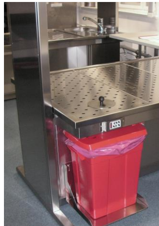
Waste shaft with extraction and PVC waste bin MÜ-AS-150-M-K Art. No. 060.012.057